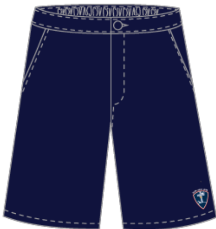
Shorts Elastic Back