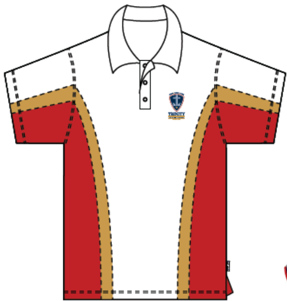
Polo Unisex Design